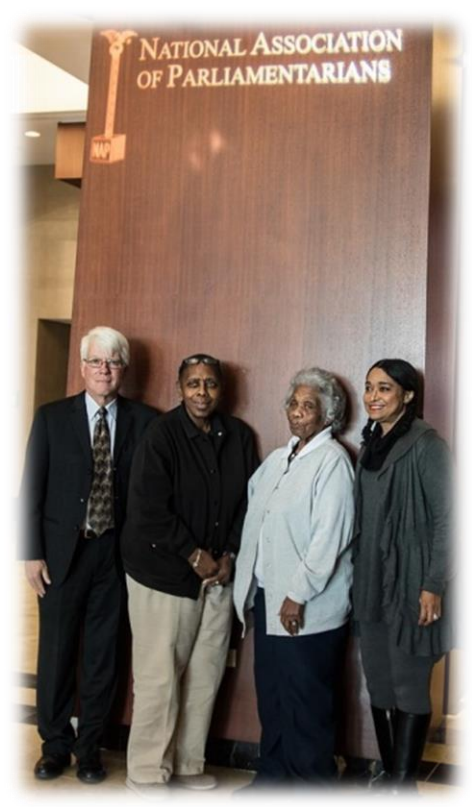
Miami Valley Unit at NAP Convention 2017