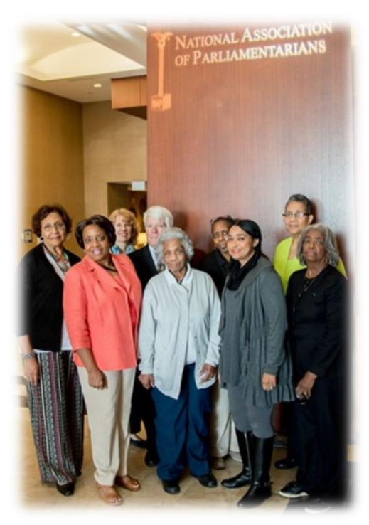
OAP at NAP Convention 2017